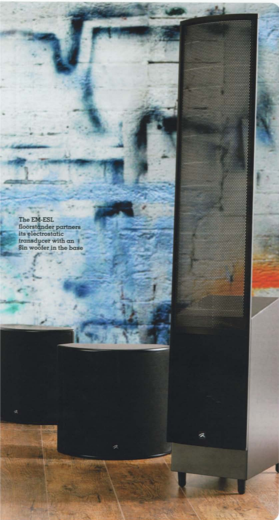
The EM-ESL floorstander partners its electrostatic transducer with an 8in woofer in the base

Each one boasts a 34in tall XStat electrostatic transducer held rigidly within the same aluminium/composite AirFrame structure found on the brand's flagship designs, providing electrical and acoustical isolation to lessen distortion.